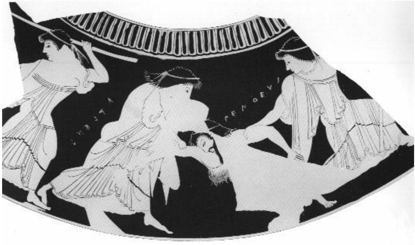
Pentheus torn apart